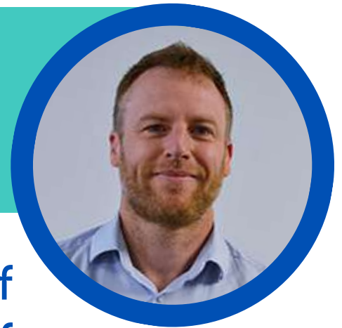
Director of People & Places